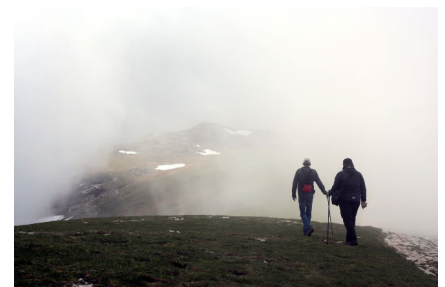
PWD50 reports meteorological visibility reliably from 10 meters to 35 kilometers (from 32 feet to 21 miles).

Thousands of PWD series sensors have been installed all around the world. They have undergone rigorous test programs. In the field, the sensors have demonstrated very low failure rates. They have proved their robustness in the harshest climates and most demanding conditions, ranging from offshore to desert and from airport to roadside.