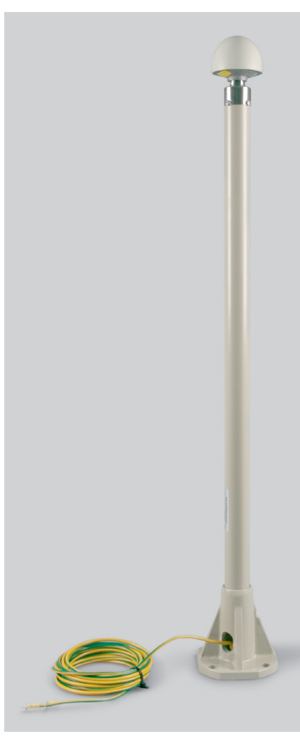
Vaisala telemetry antenna RM31N and GPS antenna GA31N are well suited for example for naval installations