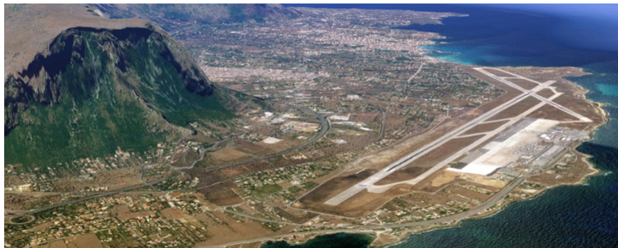
Picture showing Palermo runways and the unique geographic scenario. Nearby Monte Pecoraro.

The proven Vaisala weather radar IRIS software suite was included in the delivery to present the weather scenario detected by wind lidar and X-band Radar subsets graphically and to provide accurate related wind shear alarms. Eurelettronica ICAS and Vaisala delivered the tailor-made solution to Palermo Punta Raisi Airport during the summer of 2017. It is expected that there might be a need for similar integrated solutions in several bigger airports with severe wind challenges.