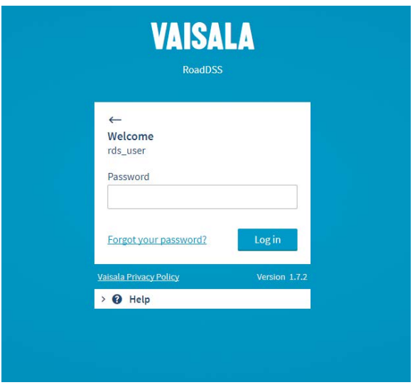
Step 2. Enter password