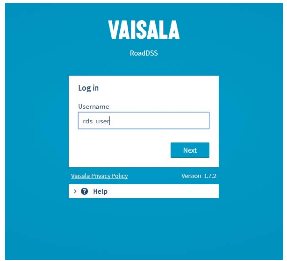
Step 1. Enter username

Please continue to login as usual with your existing username and password.